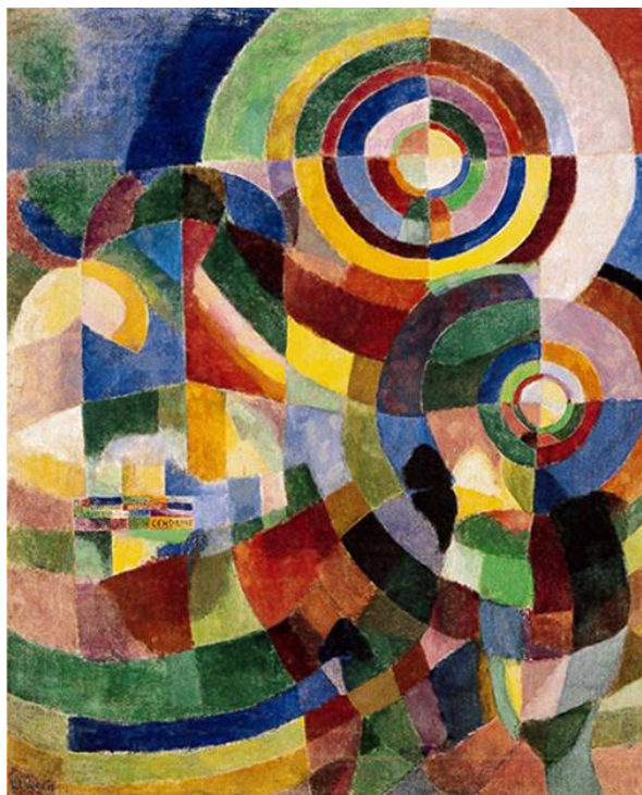
PRISMES ELECTRIQUES, 1914 - SONIA DELAUNAY